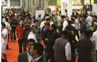
The first edition of the SMAP Expo Abu Dhabi opens its doors tomorrow at ADNEC, showcasing Moroccan real estate investment opportunities for thousands of UAE based investors. Enlarge »

SMAP Expo Abu Dhabi is a part of an expansion project that the SMAP Group is undertaking to explore new markets in the Middle East and Europe, which include the Kingdom of Saudi Arabia (SMAP Expo Jeddah), and the UK (SMAP Expo London).